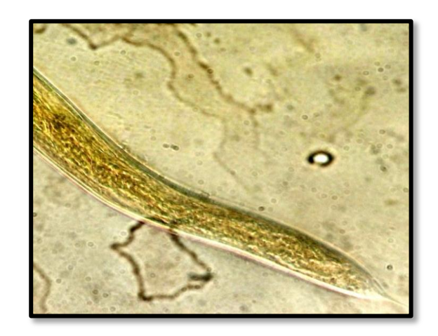
Fig. 4: Posterior end of Dictyocaulus larva (40X)