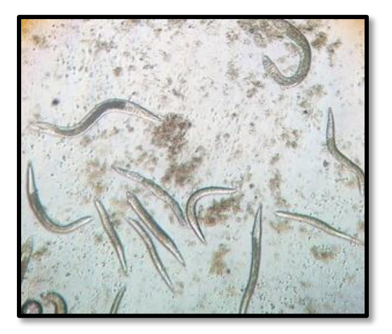
Fig. 1: Dictyocaulus larvae in the concerntrated feacal specimen by floatation technique (10X)