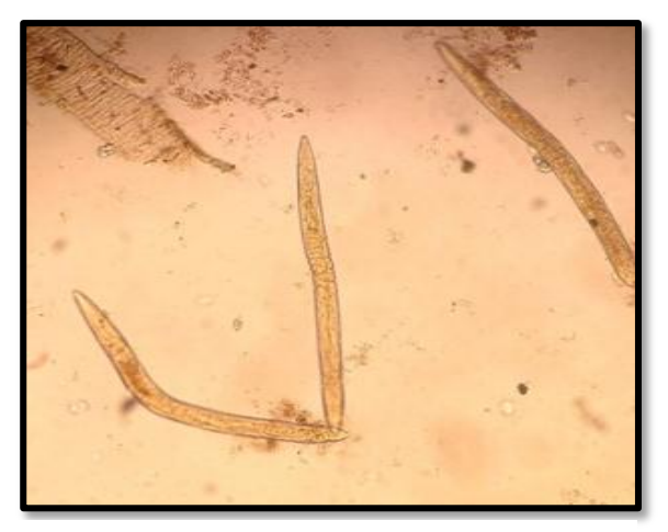
Fig. 2: Dictyocauluslarvae after staining (10X)

The prevalence of Lungworm (Dictyocaulus sp.) infection in the captive spotted deer, even in those animals that appeared apparently healthy although they were harbouring the parasites suggested that infections routinely are sub-clinical in these animals and they may serve as carriers or reservoir host for these infections. So, proper investigation needs to be undertaken, as well as the presence of vectors and intermediate hosts of the prevailing helminthic parasites should be eliminated in order to control parasites in these captive animals.